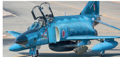
Last Samurai Japan's final F-4s at Hyakuri

March 2019 Issue 372 £4.99 US $12.99 CAD $14.99 AUS $13.30