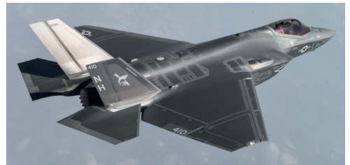
Navy Lightning IIs VFA-147 'Argonauts' transition to F-35C