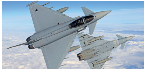
Luftwaffe under test Preparing for the high-end threat